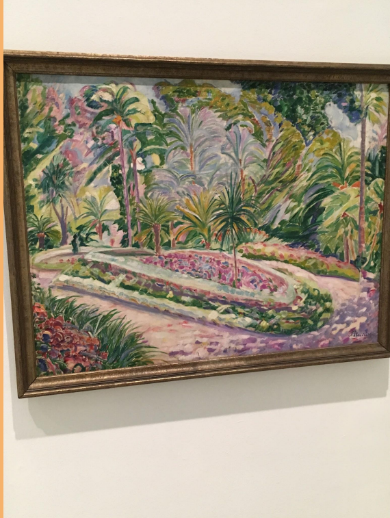
Francisco Iturrino, Malaga Garden