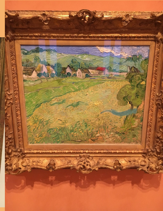
Vincent Van Gogh Les Vessenots in Auvers