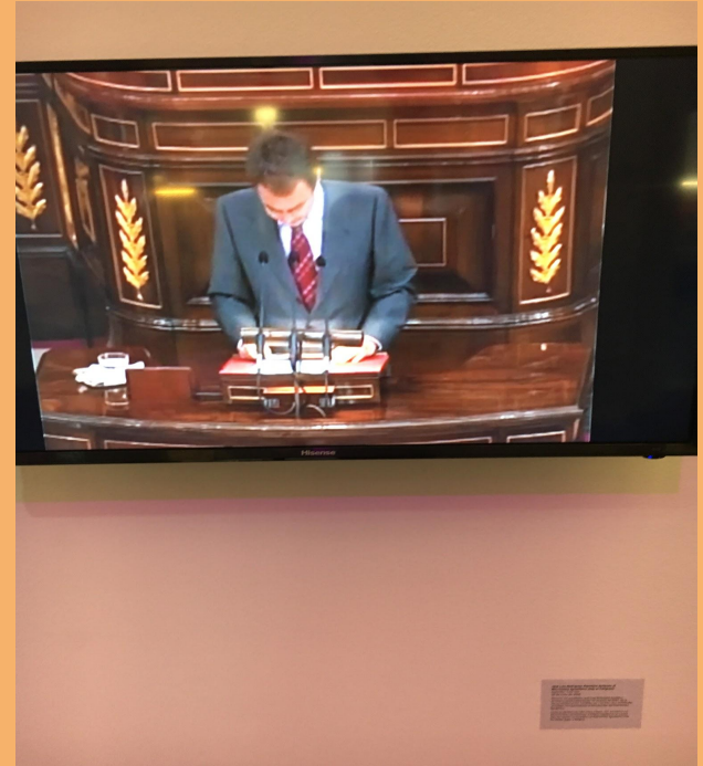
The passing of a gay marriage law in the Spanish parliament in 2005.