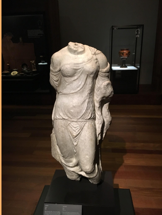
Aphrodite 2nd century