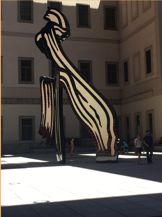
Statue outside of Regina Sophia Museum