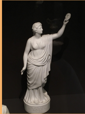
Muse of Comedy

During my five-week experience in Madrid, I took a course on underworlds and afterlives. This course gave me an opportunity to see ancient art and theater.