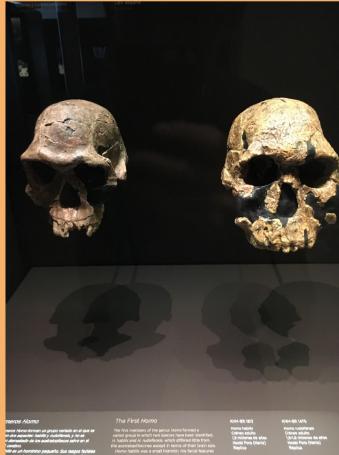
Homo Habilis and Homo rudolfensis