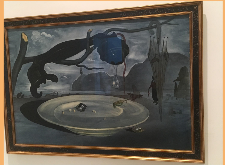
Salvador Dalí The enigma of Hitler