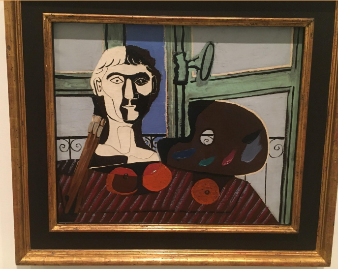
Pablo Picasso self portrait