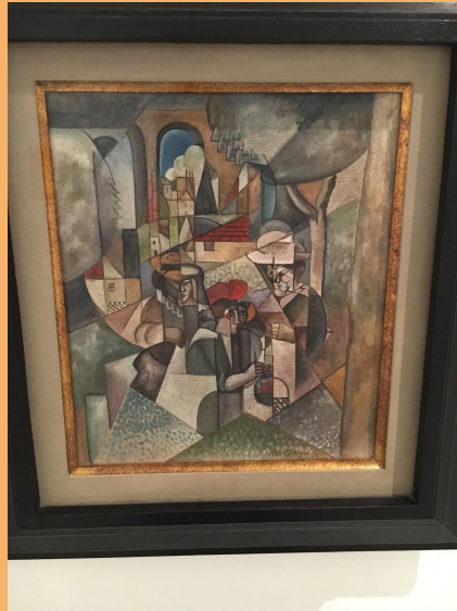
Albert Gleizes Women sewing

In Madrid I visited the Prado Museum and the Regina Sophia Art Museum.