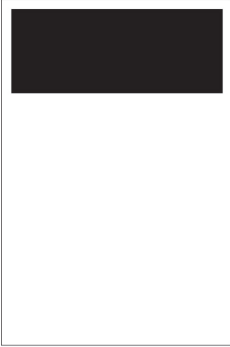
quarter page horizontal 5.5 X 2.19